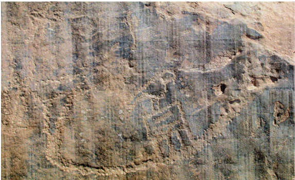
Tallet, 2015 p. 66, fig. 42; pls. 25-26