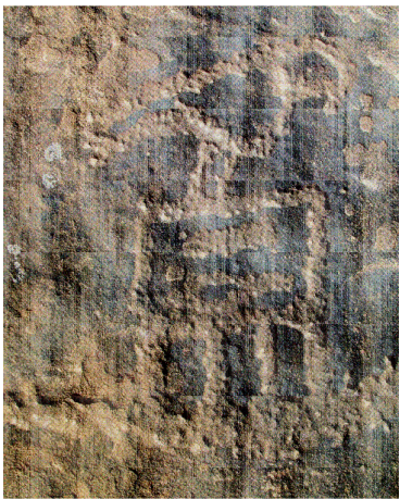
Tallet, 2015 p. 66, fig. 42; pls. 25-26