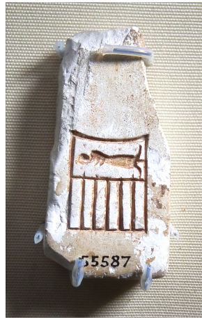
Renée Friedman, personal communication, 2015