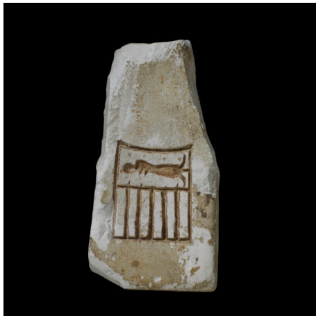
British Museum ( London )